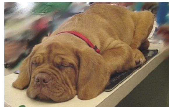
Satyam Bennet, Dogue de Bordeaux at 8 weeks

**Enrollment and monthly fees are subject to change at any time.